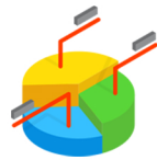
Dynamics 365 Sales