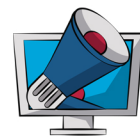
Dynamics 365 Marketing