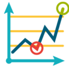
Finance and Operations

We completed a full-scale implementation of Dynamics 365 solutions for ACWA Holding Group , which included modules like time and labor (T&L), service management, manufacturing, project accounting, and quality management. Our team fine-tuned the solution to boost ACWA Holding Group's operational efficiency and competitiveness. The following modules were successfully implemented: