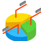
Dynamics 365 Sales