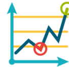
Finance and Operations