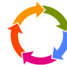
Supply Chain Management