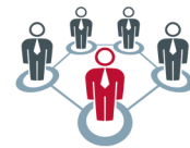
Dynamics 365 Human Resources