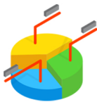
MS Dynamics 365 Business Central