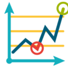
Dynamics 365 Finance