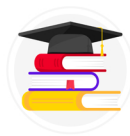
Dynamics 365 Education