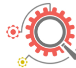
Dynamics 365 Field Service