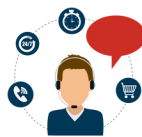
Dynamics 365 Customer Service