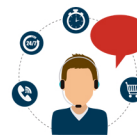
Dynamics 365 Customer Service