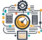
Project Service Automation (PSA)

We began the process of tailoring and integrating Dynamics 365 solutions for AXPulse , concentrating on enhancing service delivery, project management, Business Central, and CRM functionalities. Our team conducted thorough analysis to ensure alignment with AXPulse's distinct needs, and subsequently, we implemented the following modules: