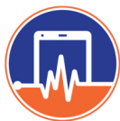
Dynamics 365 Healthcare Accelerator

Our team facilitated an in-house implementation of Dynamics 365 solutions for Mazik Global , leveraging Sure Step methodology. Additionally, we designed a medical vertical, Mazik Care, to cater to specific healthcare needs. We collaborated closely with Mazik Global's team to customize the solution, ensuring seamless integration with their existing systems and processes and implemented the following modules: