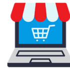
MS Dynamics 365 Commerce