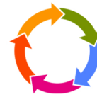
Dynamics 365 Supply Chain Management